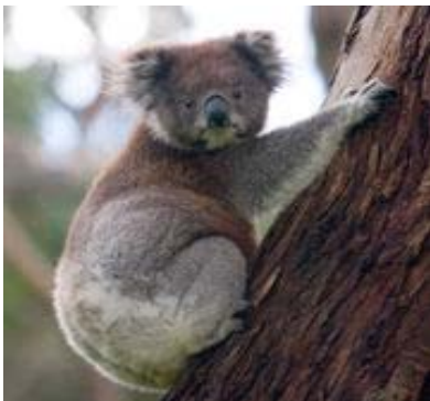
The Koala bear, indigenous to Australia, is not related to any kind of bear.

Australia is now one of the world's most multicultural societies, with around 220 nationalities, and there's a growing Asian influence to be aware of. In New Zealand, the indigenous Maori population is asserting itself, both economically and culturally. The Maori language has official status, alongside English.