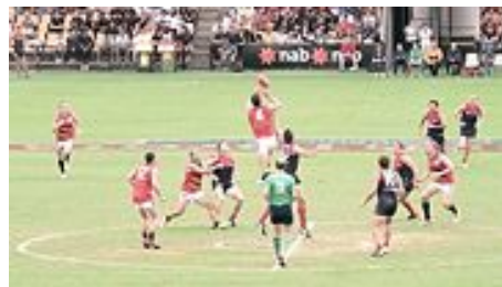
'Aussie rules' football, played in Australia and New Zealand.