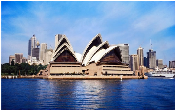
Sydney Opera House and harbour