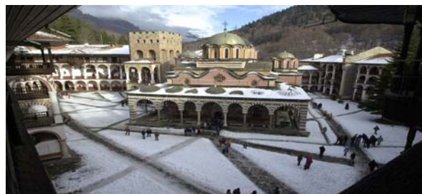
The Rila Monastery in southern Bulgaria.