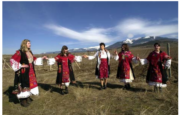
Bulgarian farmers dressed in traditional costumes performing a ritual during a traditional national wine festival for a good wine harvest in the village of Ilindenci, some 120km south of Sofia.

“After considering many markets, many on the outside looking more appealing, Bulgaria offered far too many benefits for us to ignore. Regular visits and in-depth research along with the development of long-term relationships means we have a very stable future that will only grow with EU enlargement” – Sarenmo UK.