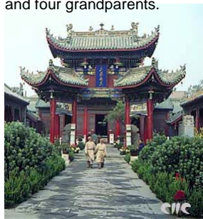
The Assembly Hall of Shanxi, Shaanxi and Gansu, Henan Province

Population control has been very successful, and the growth rate is below 1%. This has, though, resulted in an ageing population, and a phenomenon of a generation of 'little emperors' who are adored and spoiled by two parents and four grandparents.