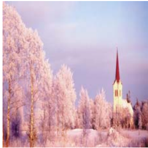
Joelaehme church established in the 14 th century

Estonia today: Estonia is the northernmost Baltic State and with a population of only 1.4 million, it is also the smallest. On 20 August 1991 Estonia re-established independence and in 1994 the last Russian troops withdrew from the country. Rapid development of the communications infrastructure followed and the capital city, Tallinn, is now particularly technologically advanced and produces half of the country's GDP. Estonia has done well since gaining independence due to its favourable location and strong Scandinavian links, particularly with Finland and Sweden. An excellent business environment and conditions for production, liberal economic policy and