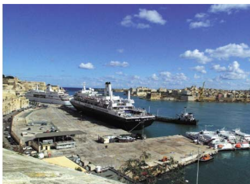
Cruise liners in the Grand Harbour of Valletta.

Phoenicians, Carthaginians and Romans left their traces, to be followed by Arabs and Normans. The Knights of the order of St John made the island their headquarters from the 16 th century and built great fortifications, palaces, public buildings and St John's Cathedral with its eight ornate chapels dedicated to each of the lingues or nations of the Order.