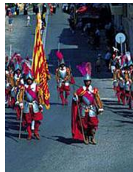
One of Malta's many festivals – celebrating 7,000 years of culture on the island of Gozo.