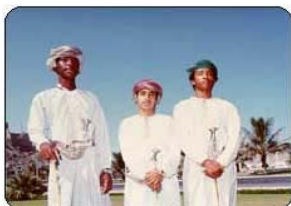
Above, national dress for Omani men

Though costumes vary from region to region, the main components of an Omani woman's outfit comprise a dress worn over trousers ( sirwal ) and a headdress, called the lihaf .