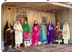
Above, national dress for Omani women

Since the slump in oil prices in 1998-99, Oman has made active plans to diversify its economy and is placing a greater emphasis on other areas of industry. These include natural gas, minerals, manufacturing, agriculture, fishing and tourism.