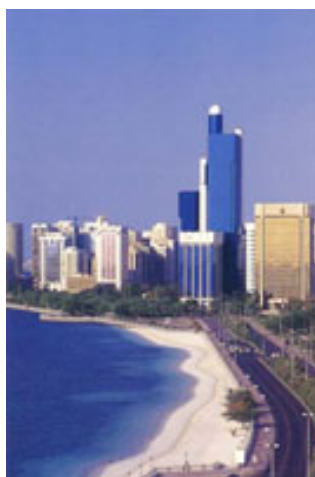
Above, Abu Dhabi, the capital

The official religion of the United Arab Emirates is Islam. But other faiths are tolerated and freedom of worship privately is given. Churches are common in some emirates and in Dubai you will even find a Hindu Temple.