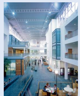
The Met. Office in Exeter, providing services globally

Well, people are four times more likely to do business using an own-language site. For example, Germans are 15 times more likely to book a holiday to the UK using an own-language website.