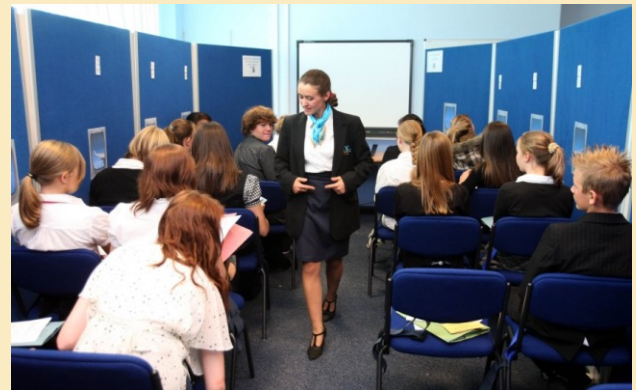
En el avión - listo para salir (On board - ready for take-off)

in business today. UK Trade and Investment, supported by Frugi's Cut4Cloth Range, delivered a workshop to show how foreign languages aid exporting products overseas. Cornwall Education Business Partnership also ran a workshop session and together with UKTI and the school, launched the new Passport to Export Competition for 2008/9.