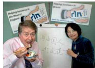
Try a Japanese-style breakfast before the language and culture briefing

The University of the West of England invites you to a free event to help you to bridge culture barriers and take advantage of trading opportunities with international customers. A breakfast with a Japanese flavour will be provided before a Japanese language taster session, followed by a business briefing on China and a discussion on developing a foreign language and cultural strategy for your business.